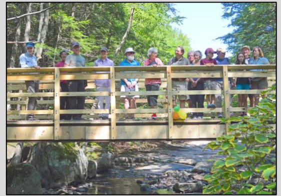
Brookside Park Bridge over Skinner Brook