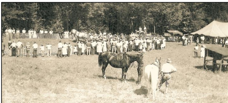
Grantham Fairgrounds, 1951

When the Town purchased the additional land, access to the park's trails had been cut off for years – a result of a bridge over Skinner Brook having been washed away by a surge of spring snowmelt. With support from the Jack and Dorothy Byrne Foundation, the Commission constructed a handicapped-accessible bridge and trail across and along a short section of Skinner Brook. Trails that were re-established and continue through the park are interspersed with signs briefly explaining various features of interest. Each sign also displays a QR code one can scan with a smartphone to gain additional information about specific features.