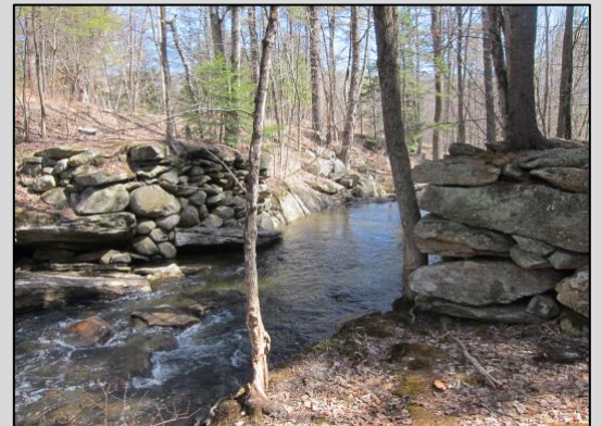
Old bridge abutments at Skinner Brook