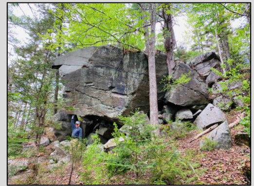
Sherwood Forest from Rockledge Trail

Fisher Lot is named for the Fisher family that once lived there. A cellar hole and a small family cemetery remain. The Lot now contains a grove of chestnut and apple trees along with a meadow of wild flowers. From time to time logging operations to improve wildlife habitat and encourage biodiversity are scheduled by the Conservation Commission to take place in the forest.