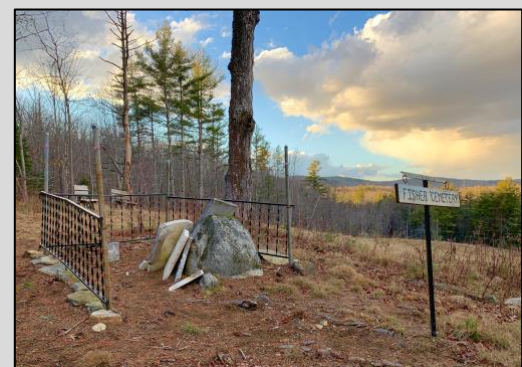
Fisher Cemetery and Meadow