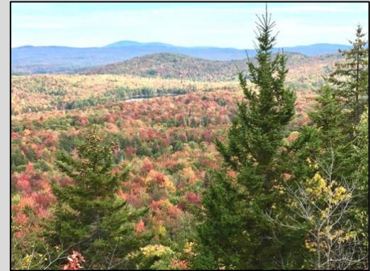
View from Little Mt. Washington