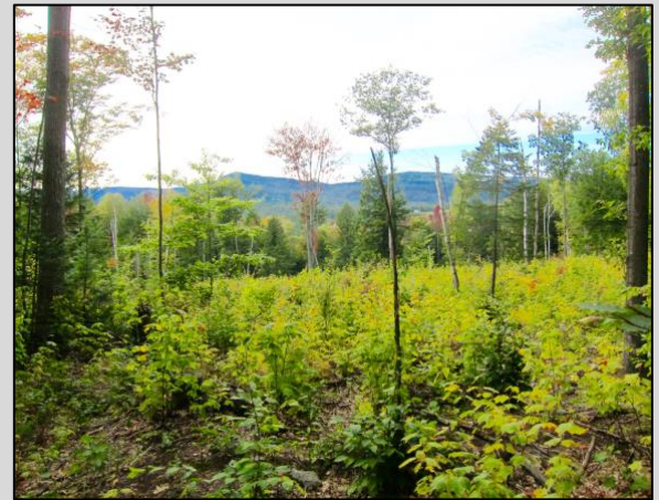
Reney Forest View of Croydon Mountain and Grantham Peak through a Clearing