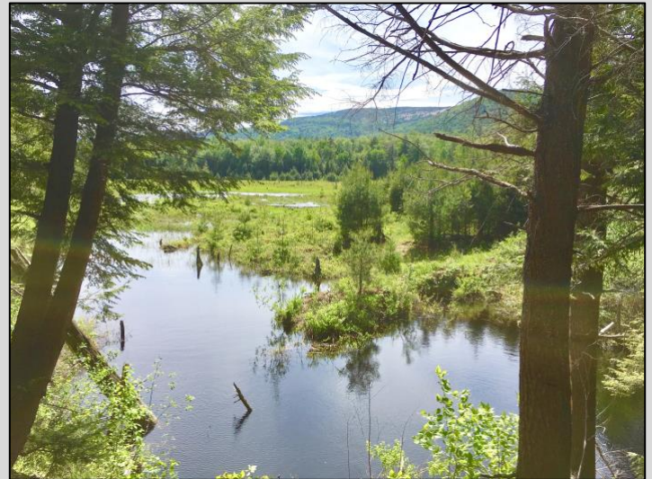
View over the Beaver Pond Wetland